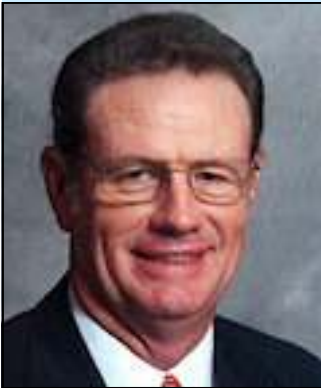
Judge Executive Daryl Greenfield Todd County