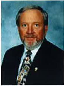
Senator Joey Pendleton (D)